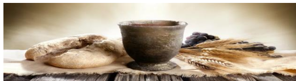
Communion Sunday September 1st

Of course, either organization would accept monetary donations as well.